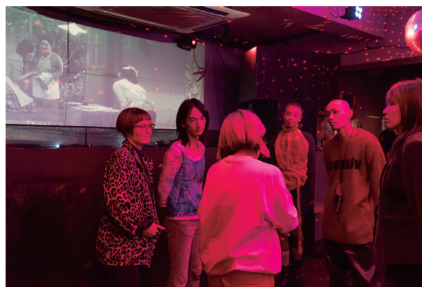
Production still of "Dance Floor as Study Room - A Prelude" (2024)

The exhibition questions the moral standards in contemporary society by shedding light on colonial, patriarchal, and other dominant attitudes, as well as discrimination, social conflicts, and personal struggles they cause. We are looking forward to your visit and participation.