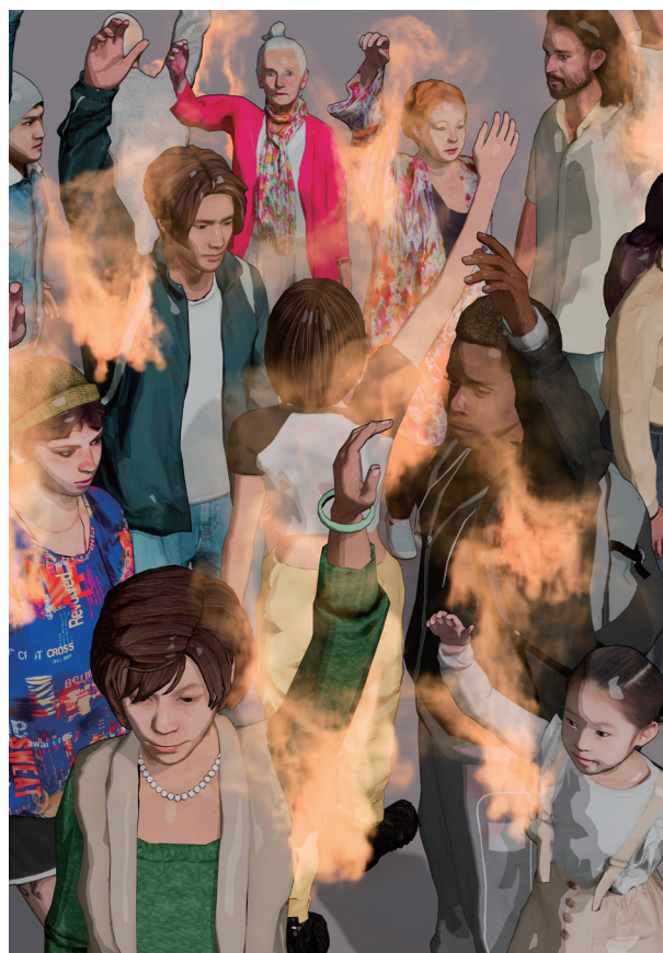
Main visual by Shota Yamauchi

The existence of scent brings about an unconscious boundary between people, despite today’s communities often requesting tolerance to accept others. “Monument of Odour” will share hints to think deeply about technology and ways of communication in our contemporary society through a unique experience designed around odour.