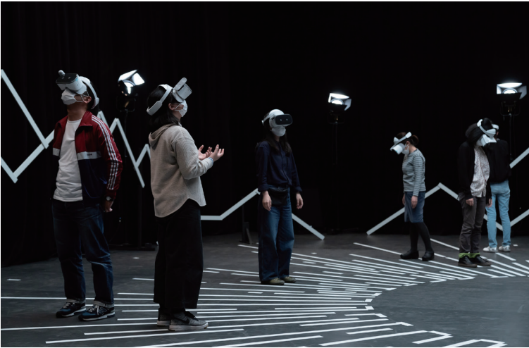
Prometheus Bound, 2021